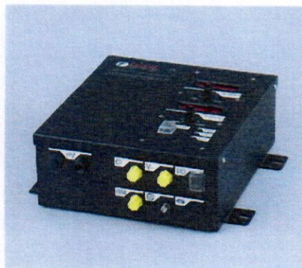
7360 (30kV) and 7560 (50kV) Generator

Please see separate datasheets for generator specifications etc.