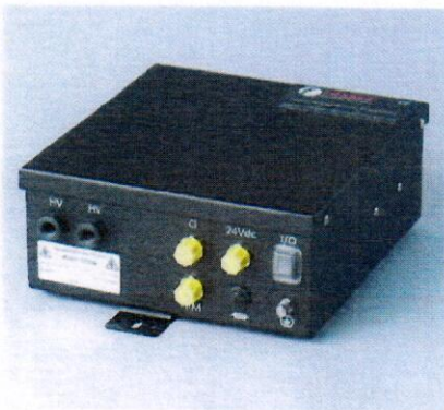
7333 (30kV) Generator